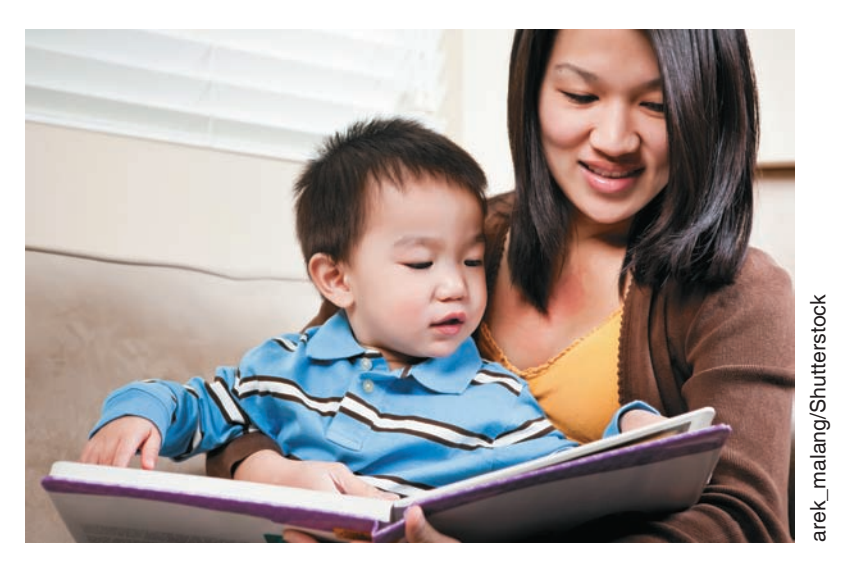
Language forms the foundation of our perceptions, communications, and daily interactions.

aspects of language knowledge is present in any interaction in which language is used. Initially, a child's knowledge of the aspects or components of language will be only receptive. This means the child will perceive the specific characteristics of language but will not be able to produce language that demonstrates this knowledge. The sections that follow describe each of the five aspects of language knowledge, along with examples illustrating each aspect.